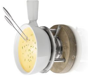
34-02-01 FONDUE SET GREY 1L