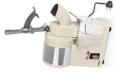
80-10-11 CHEESE GRATER RETAIL, 220 VOLT