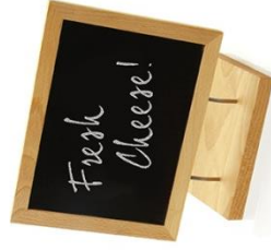
20-99-77 CHALKBOARD A5 WITH STANDARD