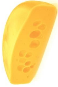
36-00-14 CHEESE REPLICA LEERDAMMER (MODEL), HALF, YELLOW