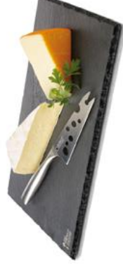
35-90-10 CHEESE SET CHEESY 'L' SLATE