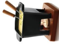
85-35-30 TAPAS FONDUE BLACK 200GR