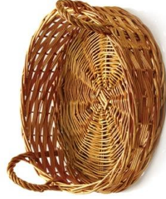
20-99-94 WICKER BASKET, LIGHT, ROUND, WITH HANDLES