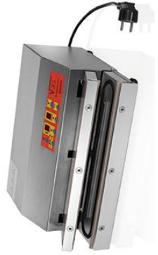
88-30-00 VACUÛM VERPAKKER V35