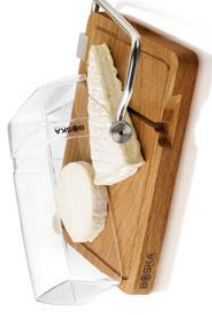
85-05-31 PETIT PARIS® OAK