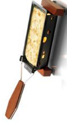
85-20-40 PARTYCLETTE® TOGO TASTE