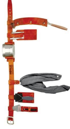
98-00-52 CHEESE PARTY BELT