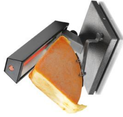
85-10-00 RACLETTE QUATTRO 220V