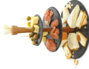
35-90-07 CHEESE TOWER®