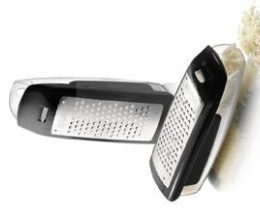
85-05-10 EASY GRATER