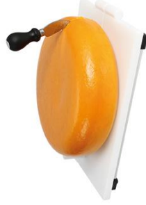
55-05-00 CHEESE-O-MATIC, PLASTIC, INCL COUNTER HOOKS