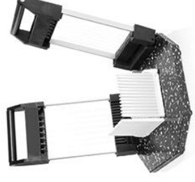
51-05-00 CHEESE BLOCKER BASE (WITHOUT CUTTING FRAMES)