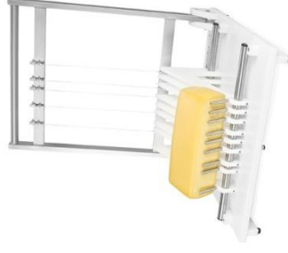
51-00-33 HOTELBLOCK CUTTER BASE