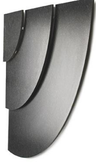
95-72-06 FOODSTEP CORNER PRESENTATION 3 STEPS, 90°