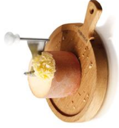
32-01-08 CHEESE CURLER FRIENDS OAK