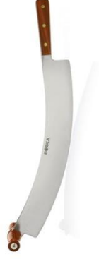
01-06-43 EXTRA LONG DUTCH CHEESE KNIFE, 430MM, WOOD