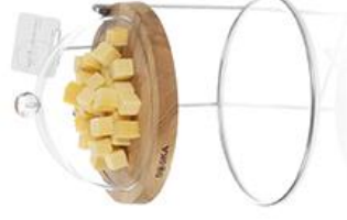
95-61-50 SAMPLE DISPLAY WITH DOME