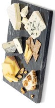
95-50-42 CHEESE BOARD MARBLE BLACK