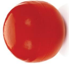
36-00-35 CHEESE REPLICA EDAMMER (MODEL), RED, Ø110XH120MM